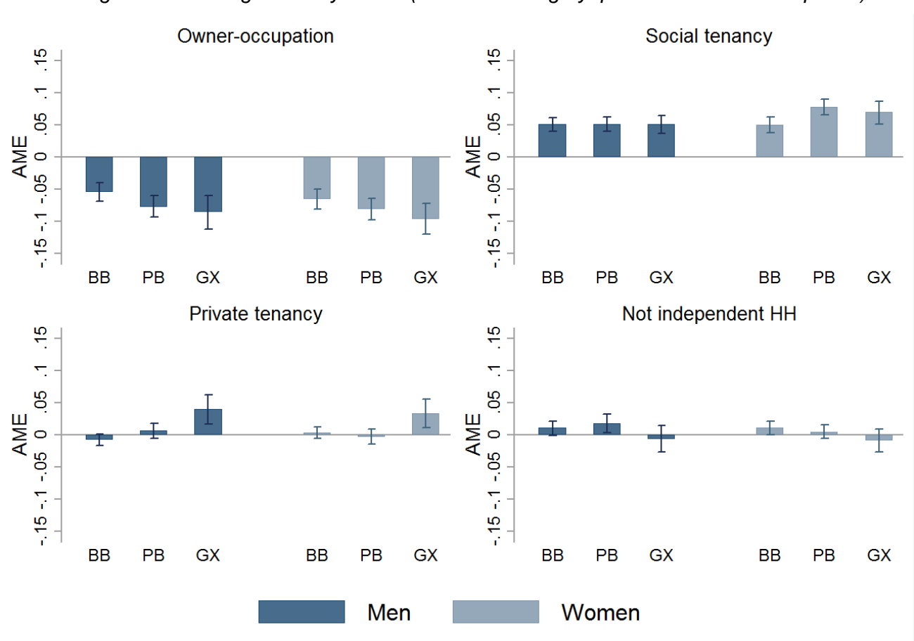
Figure 2. The average effect of parental social tenancy on the probability that young adults aged 30-34 are living in four housing states by cohort (reference category=parents in owner-occupation)

Source: ONS LS, own analysis. 95% confidence intervals.